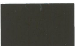
10610-81102A Chestnut Brown