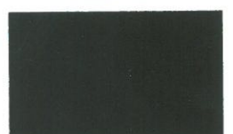
10310-80795A New Dark Bronze