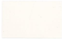
10410-12088A 11510-12203R Matte Cream