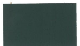
10410-61542 11410-61627R Hartford Green