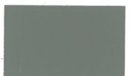
10410-72503 11410-72756R Slate Gray