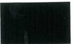
10940-92248 11710-92255R Gloss Black