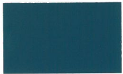
10310-51228 Interstate Blue