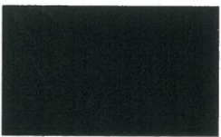
10410-92435 11410-92252R Matte Black