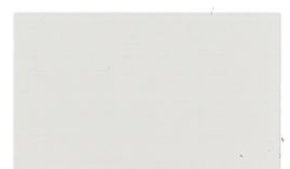
10310-92050 Polar White