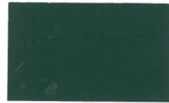
10310-61074 RAL 6005