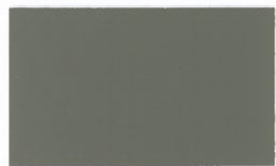
10310-71748 RAL 7006