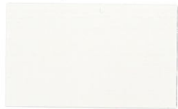
10510-91922A 11510-92253R New Bone White